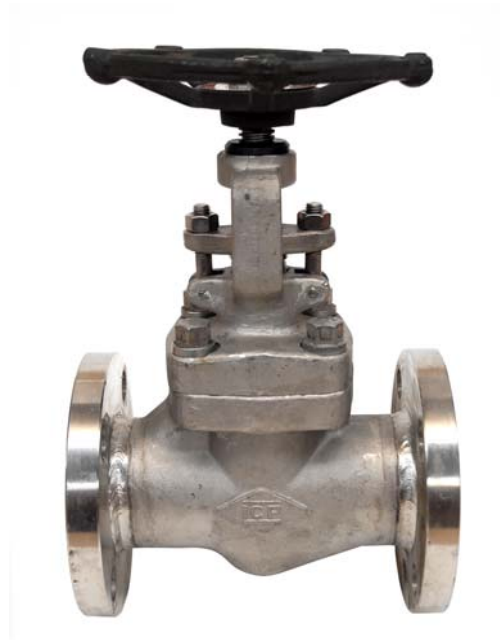
FIG. C150RF FIG. C300RF GATE VALVE